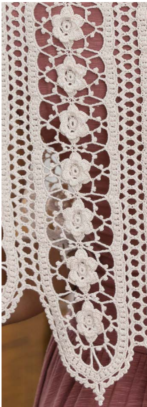
Above: Detail of panel

picot loop, ch 6, (tr, ch 4, tr) in center of next picot loop, ch 5, (dtr, ch 5, dtr) in next sc, ch 5, (tr, ch 4, tr) in center of next picot loop, ch 6, (dc, ch 3, dc) in center of next picot loop, ch 6, (tr, ch 5, tr) in center of next picot loop, ch 5; join with a slip st in 2nd ch of beginning ch-6—16 ch-spaces.