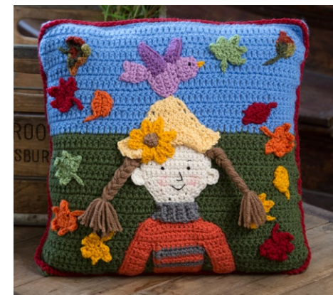
Falling Leaves Pillow LW4391