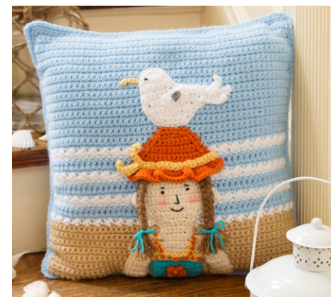
By the Sea Pillow LW4289