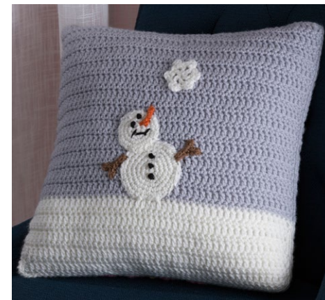
Back of Snowy Day Pillow