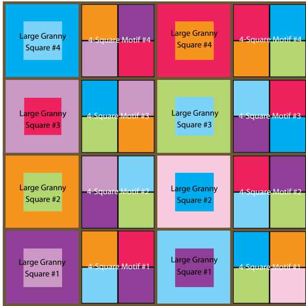
Strip 1 Strip 2 Strip 3 Strip 4